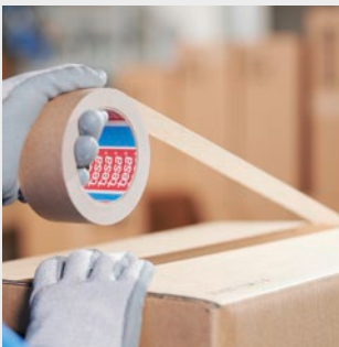
For light-weight packaging