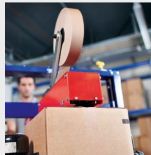
For manual and automatic application