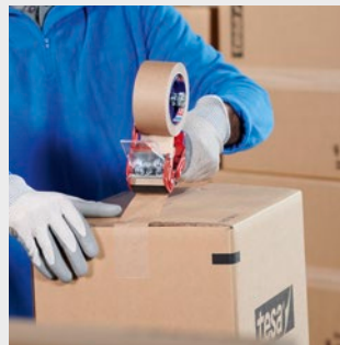
Excellent adhesion on different types of recycled cardboard